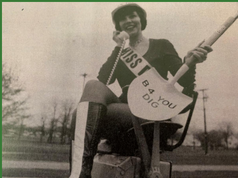
MISS DIG in the early 1970's

MISS DIG has seen some changes in 50 years.