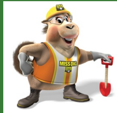
MISS DIG ready to go to work today