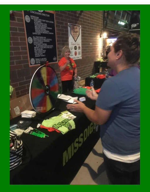
DIG 811) were up on the big screen sharing the message of safe digging.